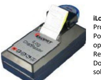
iLog Chart Reader Product Code: EI -CR Portable, Battery operated, Rechargeable, Download Print solution